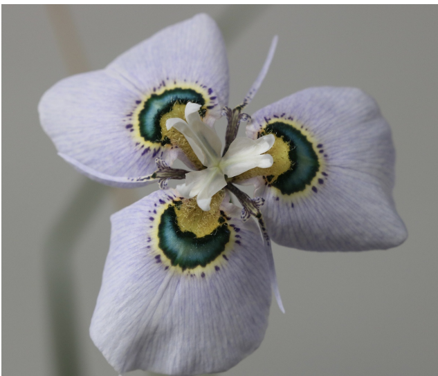
Moraea villosa [Paul Flowers]