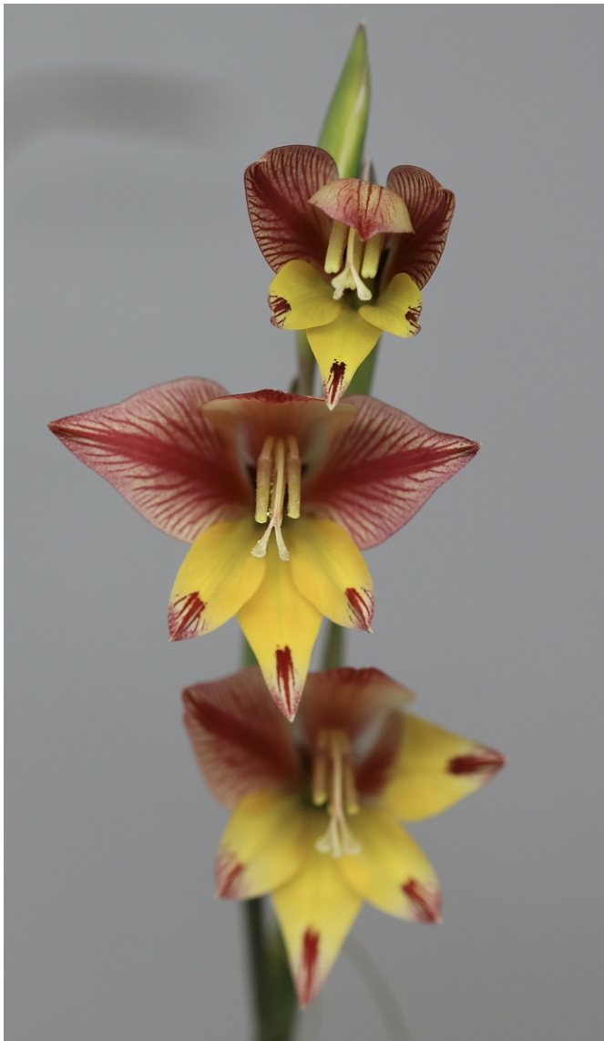
Gladiolus hybrid ( watermeyeri × huttonii ) [Paul Flowers]

I plan to produce the next Newsletter (no. 56) for distribution in autumn 2026. Contributions short or long will be most welcome, with or without pictures.