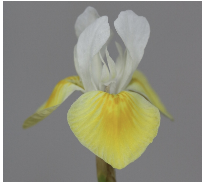
Moraea serpentina