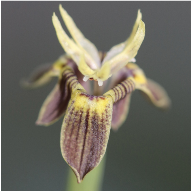
Moraea inconspicua