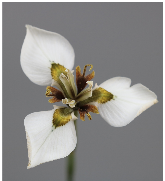
Moraea unguiculata [Paul Flowers]