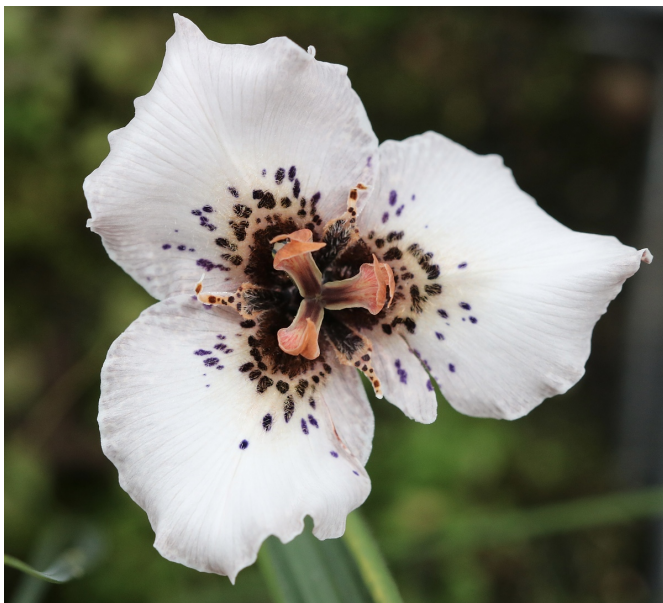
Moraea atropunctata [Paul Flowers]

For those interested in plant breeding, Moraea presents real scope for a major project. Hybridisation within sub-genus can yield a wide range of colours and patterns, making it a particularly creative pursuit for enthusiasts looking to develop new forms.