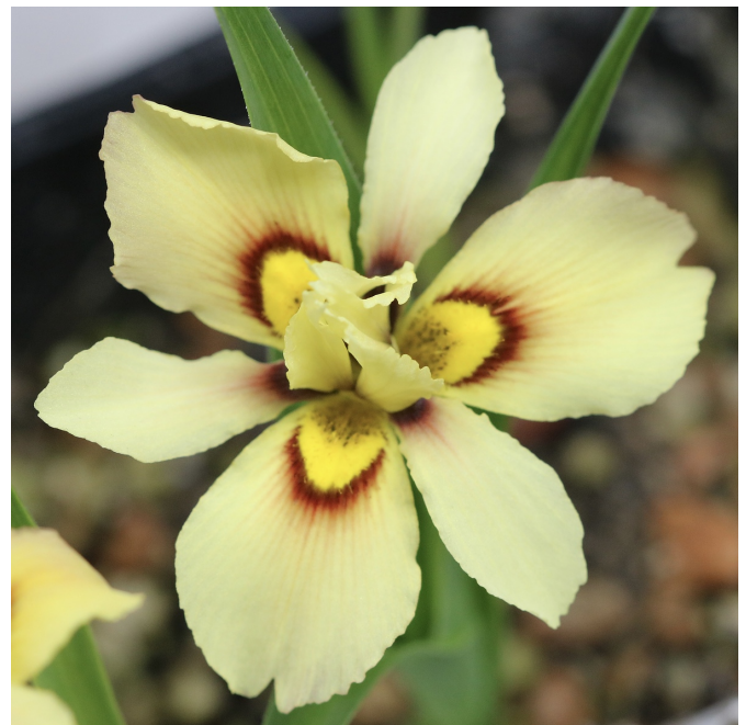
Moraea tricolor [Paul Flowers]

For gardeners drawn to unusual bulbs and the diversity of South African flora, Moraea offers a particularly rewarding avenue of exploration. These plants, many of which can be thought of as indoor “mini-irises”, combine elegance, variety and, in some cases, surprising fragrance, making them an appealing choice for growers willing to experiment and take a few risks.