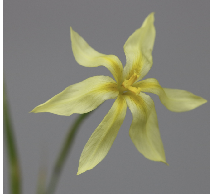
Moraea demissa [Paul Flowers]

Books for sale are also welcome on the same basis - put a paper bookmark inside with your name and price. It is very likely that we shall have some of the South African, alpine and general gardening books from Audrey Cain's library which have not been sold already.