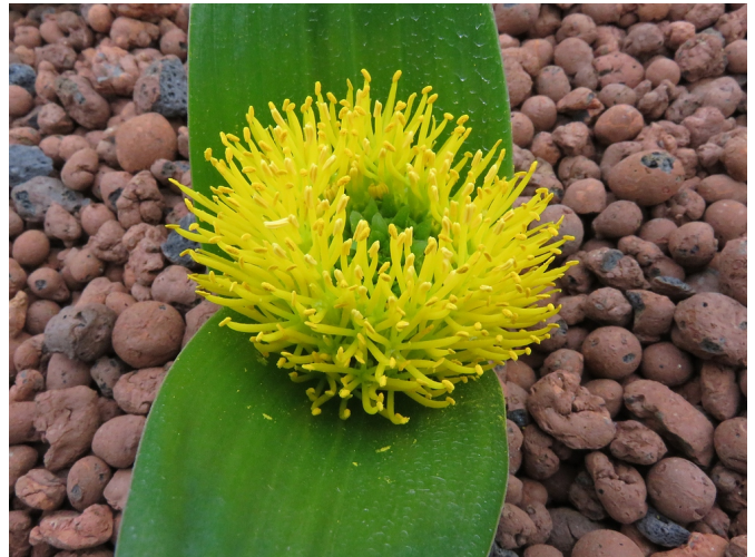
Daubenya stylosa