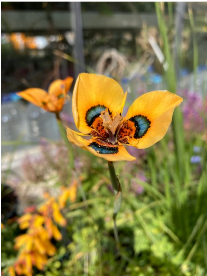
Moraea tubaghensis