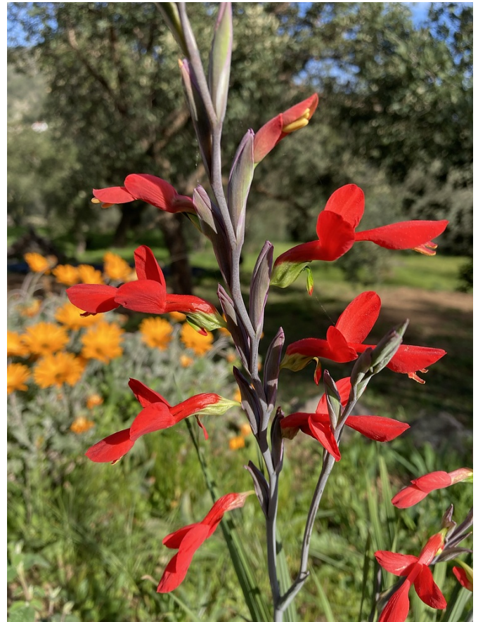
Gladiolus splendens [Uli Urban]

I have photographed the front covers of many of the books and you can browse through them in our gallery 4 on a computer, tablet or smartphone. Click on the bookcase picture to enter the “Books for Sale” album, then click on one of the books to enlarge it, then to move through the list click on < or > or use the arrow keys or swipe sideways on a phone. The background grid in the photos has 1cm squares. The book with the untitled front cover is Trauseld (1969) “Wild Flowers of the Natal Drakensberg”. You can find more information on most of these books by searching online in the usual way, or if you use Google’s Chrome browser you can go straight from the cover picture via Google Lens to search with Google without having to type anything at all (except for Trauseld’s book, even Google isn’t that clever/omniscient/scary).