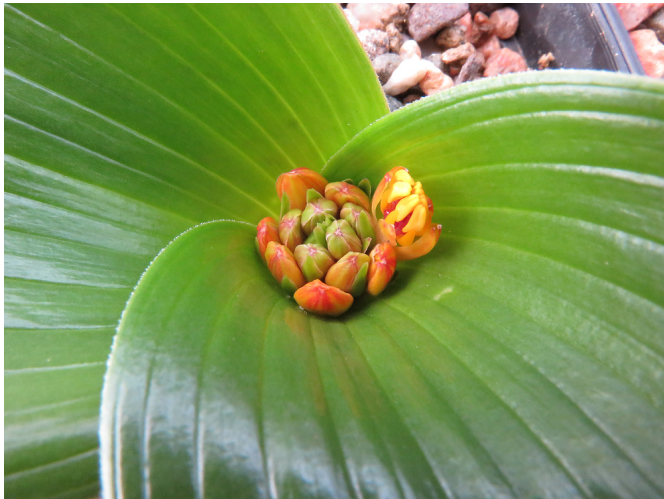
Daubinya capensis in bud [Paul Cumbleton]