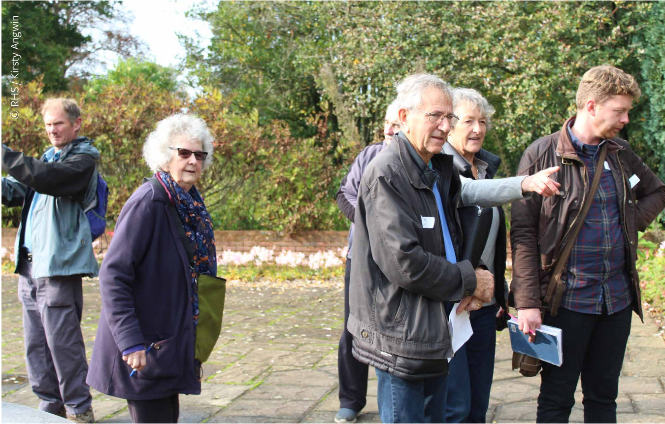
The × Amarine Roundtable forum.